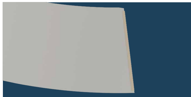
Tape seal on sidewall blank